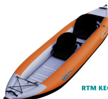
RTM KEO DUO

These kayaks are highly versatile, large and lightweight, they are adapted to both whitewater and lazy rivers. Unique self-bailing feature allows the option to open several valves on each side for quick draining.